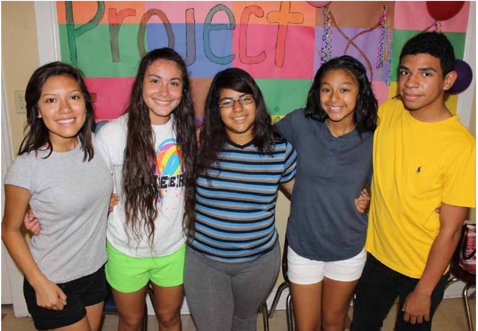
Project Transformation: Developing the intellectual and moral character of youth is important to shaping the adults of the future. Summer programming and mentorship can be an effective way to instill values and provide enrichment opportunities.