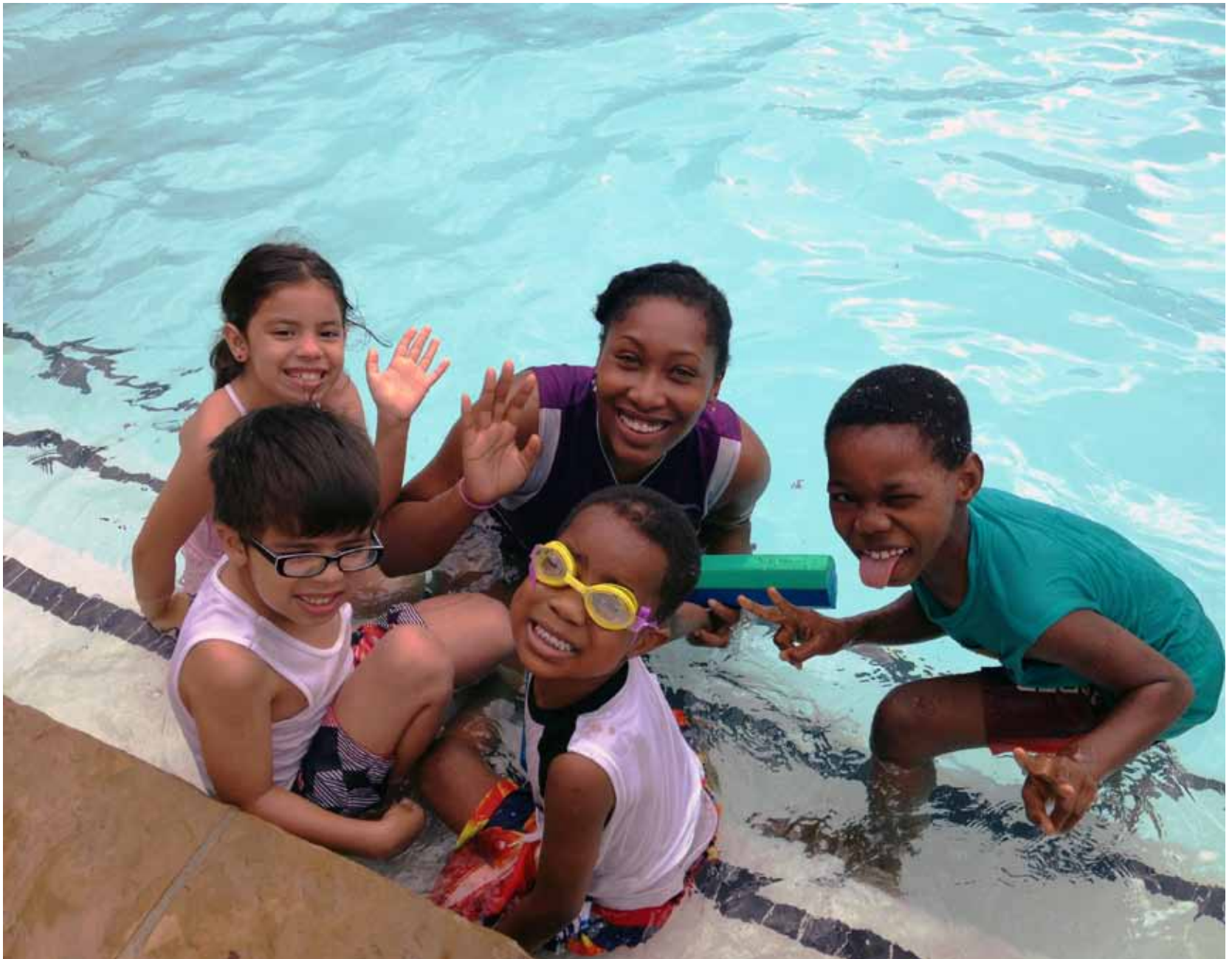
Lone Star Lifesavers: Swimming is a basic skill that young people should have... for their safety and enjoyment. Swimming lessons for youth from low-income neighborhoods are ensuring that all youth have the ability to swim.