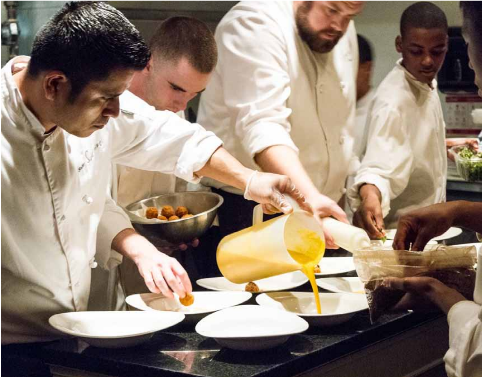
Cafe Momentum: Some youth find that early in life the mistakes accumulate and it can be difficult to see a better way to live. An innovative culinary program is providing renewed opportunity for youth to get their lives headed in the right direction and build life skills.