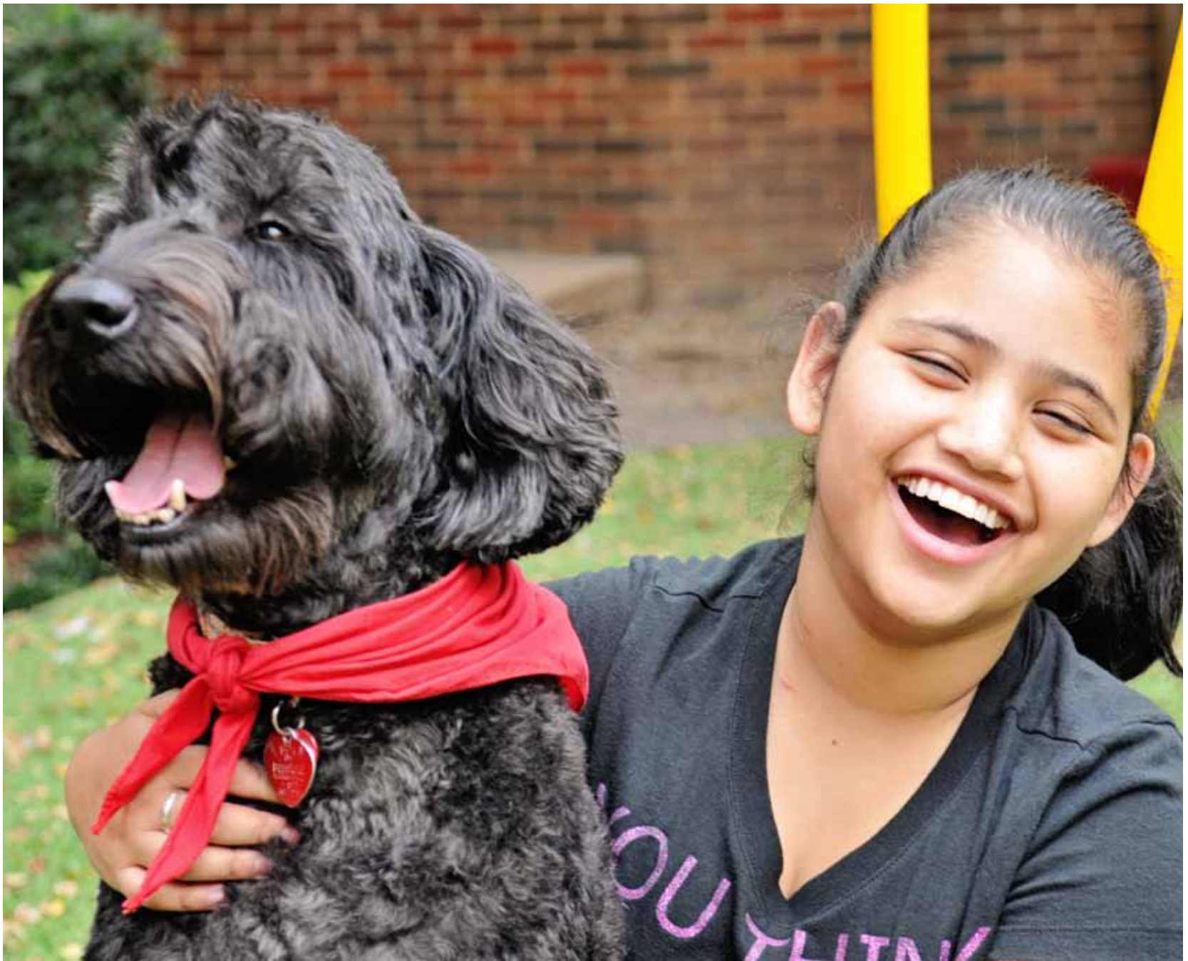
Ronald McDonald House of Fort Worth: Even in difficult health circumstances there can be joy... Joy in the companionship of a dog, and joy in the support of a community providing a temporary home during a difficult time.