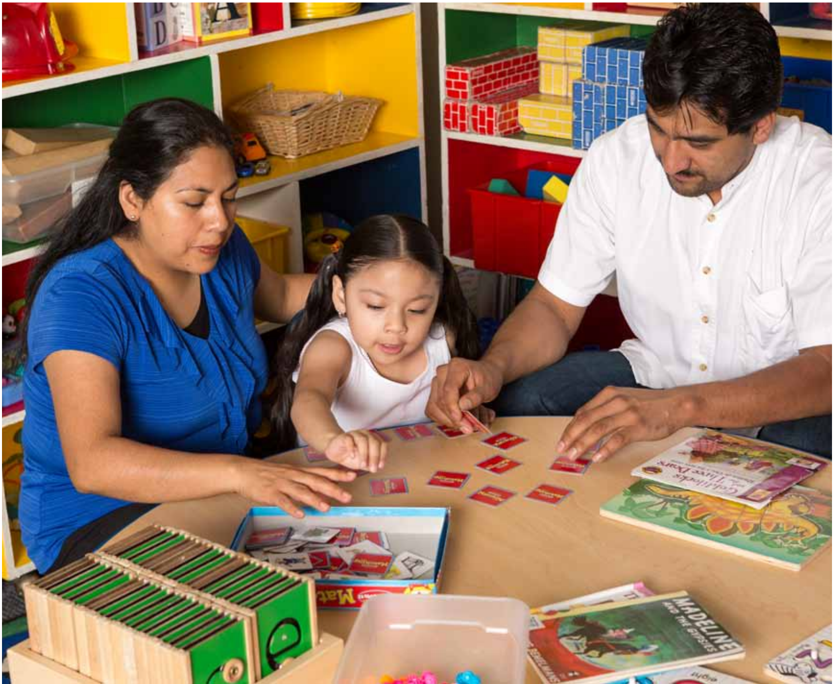
Zero to Five Funders Collaborative: Some families find themselves under-equipped to provide the early education that their children need. In the Bachman Lake neighborhood a collaborative of funders and nonprofit agencies is serving families by empowering them to be their children's first teachers.