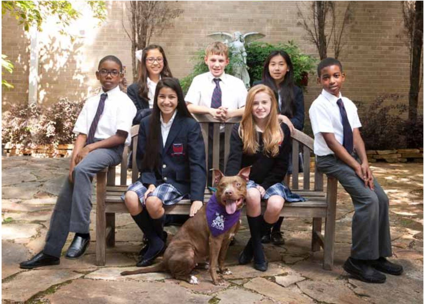
Bishop Dunne Catholic School: The Animal Well-Being Program provides an opportunity for students to explore the animal-human relationship and engage in animal welfare activities like rescue and placement.